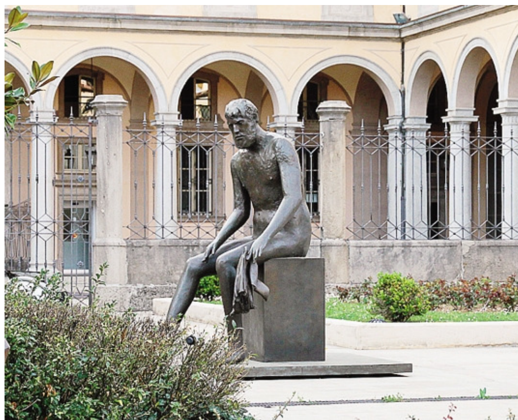
A Manzù sculpture in the courtyard of the palace of the Province

Meanwhile, on the occasion of the arrival of Pope Gio- vanni remains in Bergamo (from 24 to 10 June Thu Mag-), have previ- ste first initiatives related to the enhancement of the figure and work of the artist. These include a show in Tasso and the presentation of a map, made by the Province with the Carrara Academy Foundation, which indi- cation places and works of the sculptor in orobico territory. "We have invited the administrative nistratori of Ardea to come to Bergamo in the days when the urgent na with Pope Ron- calluses remains will be in town, it would be the best OC-tunity to begin to confront the turi Fu projects dedicated to Manzù ", ca auspi- the Provincial, cia president.