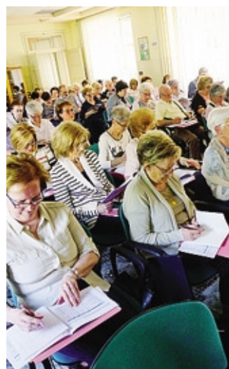
The assembly of San Vincenzo

sone and situations. So training to be better meet the needs, accompany pove- ri as a witness of charity and establish friendly relations with them. " The San Vincenzo Bertolt gamasca counts 702 members, subdivided into 75 conferences. Last year rescued 6,614 people and 1,798 households, and has managed to get out of the needed 200 people. The part most consisten-